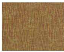
DR1002 Zenith Canyon (C) 60% Acrylic 40% Polyester