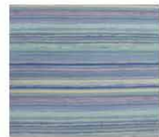
Q1009 Campmarvel Agua (E) Polyester-Railroaded