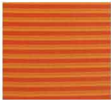
7204 Seaside Geranium (C) Acrylic -