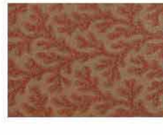
4658-59412 Hilton Head Chili (B) 53% Polyester 47% Olefin