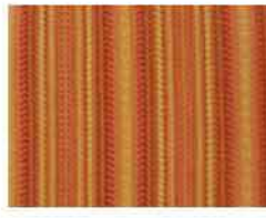
7604 Byway Citrus (D) Acrylic