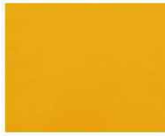
4306 Incline Canary (B) Acrylic