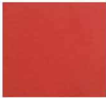
1701 Sparkle Geranium (B) Acrylic