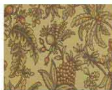
DR100 Lauderdale Canyon (C) 60% Acrylic 40% Polyester