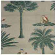
9455 Monkey Business (D) Acrylic