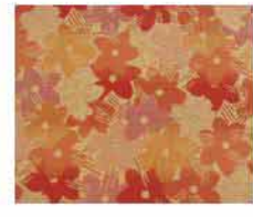
1300 Cosmos Citrus (E) Acrylic