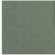
5473 Stone Green (C) Acrylic