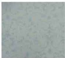
845-55005 Stockbridge Powder Blue (B) 53% Polyester 47% Olefin