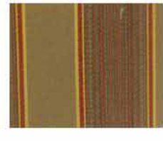
5606 Davidson Redwood (D) Acrylic