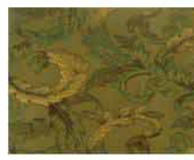
59907 Lexington Garden (B) 46% Polyester 54% Olefin