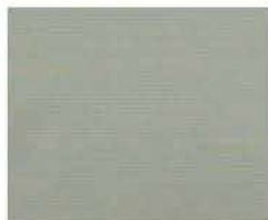
4914 Raffia Glacier (C) Acrylic