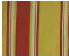
7903 Baystreet Citrus (D) Acrylic