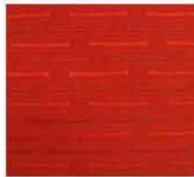
8028 Dash Crimson (C) Acrylic