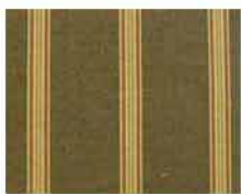
DR1001 Seacrest Canyon (D) 60% Acrylic 40% Polyester