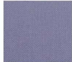
5437 Canvas Lilac (C) Acrylic