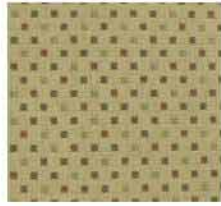
56303 Little Blocks (C) Acrylic