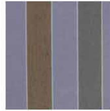
56021 Infinity Napa (D) Acrylic