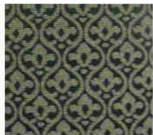
50201 Hillsboro Coal (B) 53% Polyester 47% Olefin