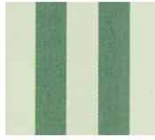
5630 Mason Forest Green (D) Acrylic