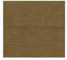
396-3972 Lasso (L) 100% Polyurethane Surface 65%-35% Poly Rayon Backing