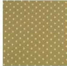
59457 Paris Oatmeal (B) 53% Polyester 47% Olefin