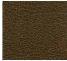
396-3970 Chaps (L) 100% Polyurethane Surface 65%-35% Poly Rayon Backing