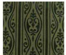
50101 Oregon Trail Coal (B) 53% Polyester 47% Olefin

All fabrics are photographically reproduced and cannot be guaranteed for accuracy