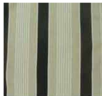
404Z Zulu Mica (D) Acrylic