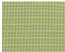
8002 Charm Grass (C) Acrylic