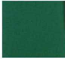
5446 Forest Green (C) Acrylic