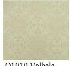
Q1010 Valhalla-bay Stone (E) Polyester-Railroaded