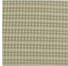
8003 Charm Beach (C) Acrylic