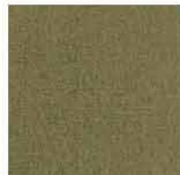
50239 Tanglewood Charcoal (B) 53% Polyester 47% Olefin