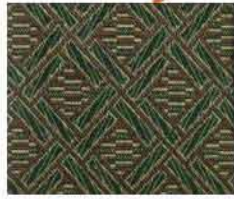
9710 Mainstream Green (B) Polyester