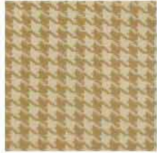
7100 Croquet Beach (C) Acrylic