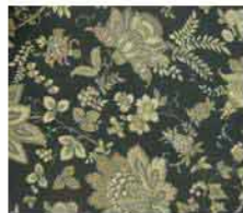
MPE Paradise Ebony (B) Polyester