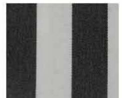
5634 Mason Black (D) Acrylic