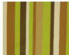
7801 Soleil Pistachio (D) Acrylic