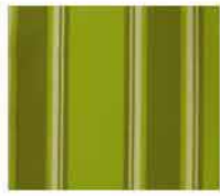
7900 Baystreet Grass (D) Acrylic